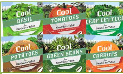
Cool Basil, Cool Carrots, Cool Green Beans, Cool Leaf Lettuce, Cool Tomatoes and Cool Potatoes.

The Newberg Public Library was able to purchase two sets of children's gardening books with money the Chehalem Garden Club donated to them using proceeds from the club's Spring plant sale. Each set has six books and are for ages 8-11. The first set is the "Cool Garden to Table" series.