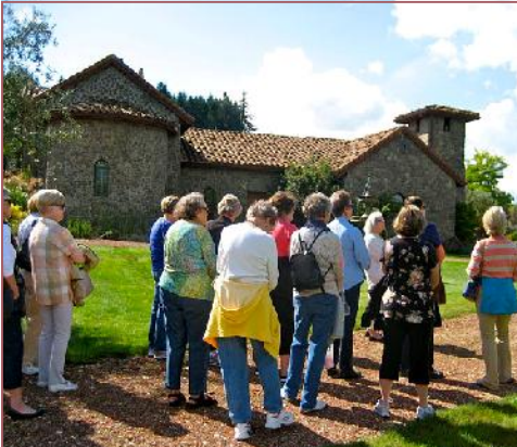
Tigard GC has a good turnout on the outing to the Rare Plant Research Nursery and the Villa Catalana Gardens