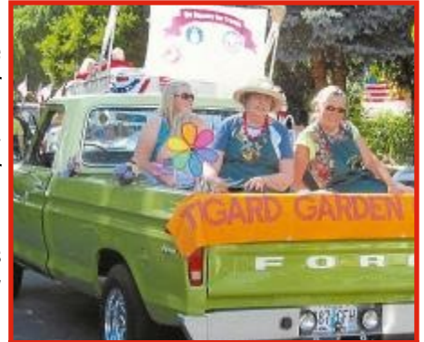
Tigard Members in Vintage Truck for "Middle of Millen Drive" Parade