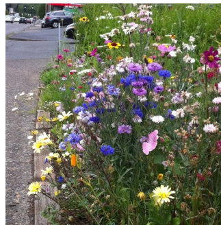
Eden's Garden—West Slope Garden Club