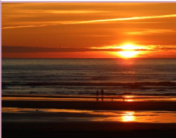
Victoria Fuller, Seaside Cove, 2nd Place, Seascape, Color Division