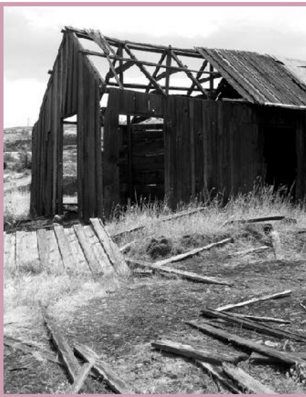
Suzy Ramm, Old Barn in The Dalles, 2nd Place, Cityscape/Architecture, Black & White Division