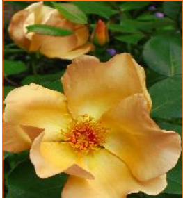
Single Hybrid Tea Rose 'Mrs. Oakley Fisher'