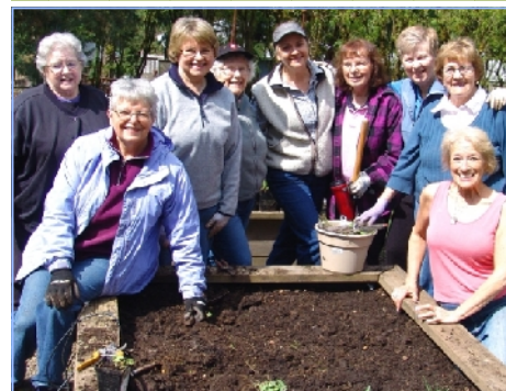
Beav'tn GC members at one of many group digs, potting plants for good selection at their May Sale