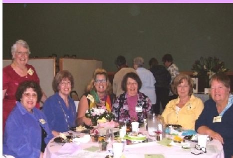
Cedar Mill Members Enjoy the Festivities