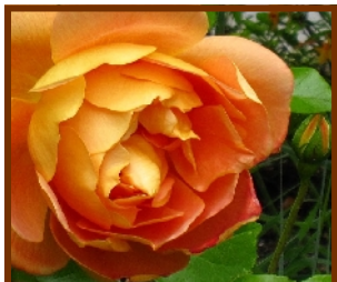
Rosa, Cl. "Autumn Sunset"