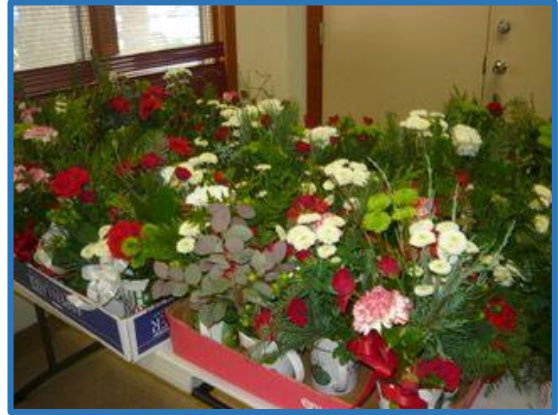
Finished bouquets ready for delivery to Hearthstone Retirement Center residents!