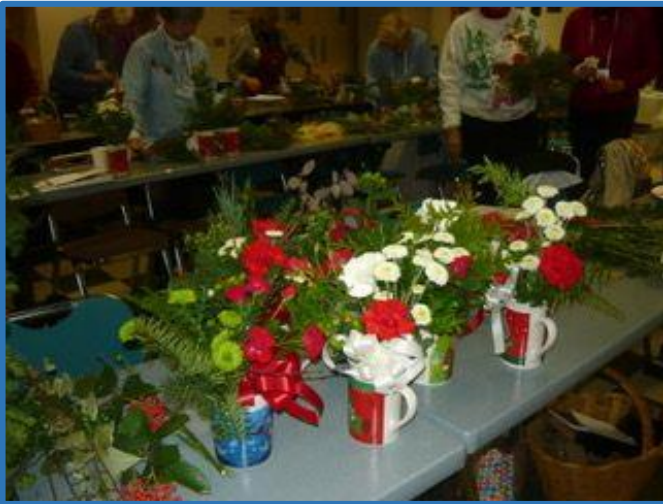
Christmas mug bouquets being completed.

Announcing National Garden Club Convention 2022 Orlando, Florida May 15-21, 2022