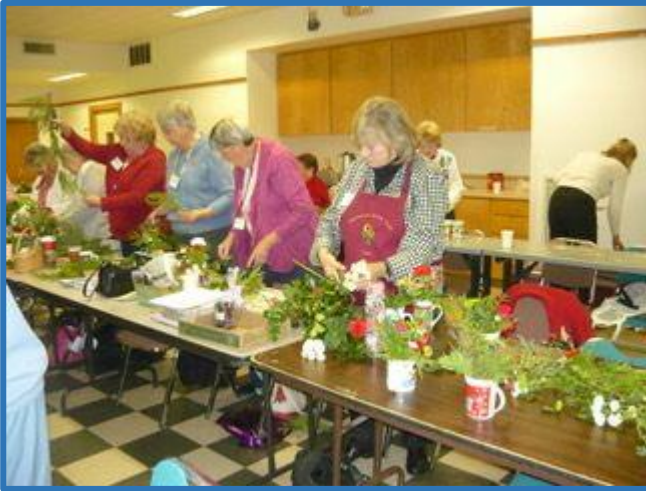
Beaverton Club members working on holiday mug bouquets.