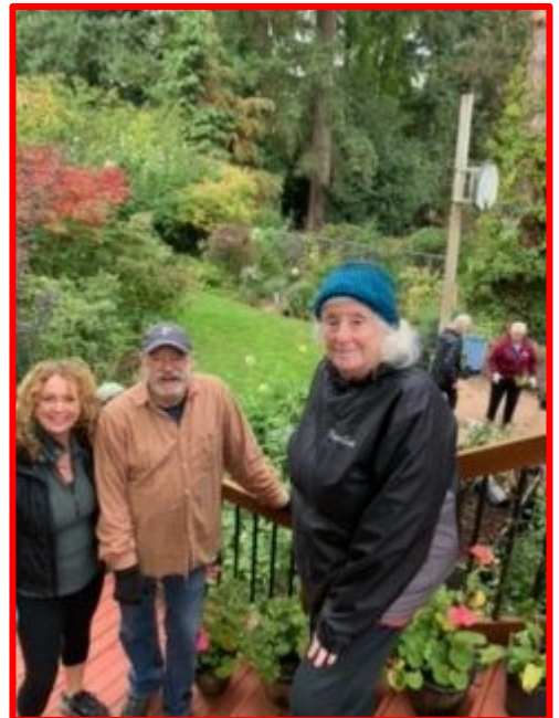
Beaverton Garden Club members gather for a fall "dig" in preparation for their annual spring plant sale.